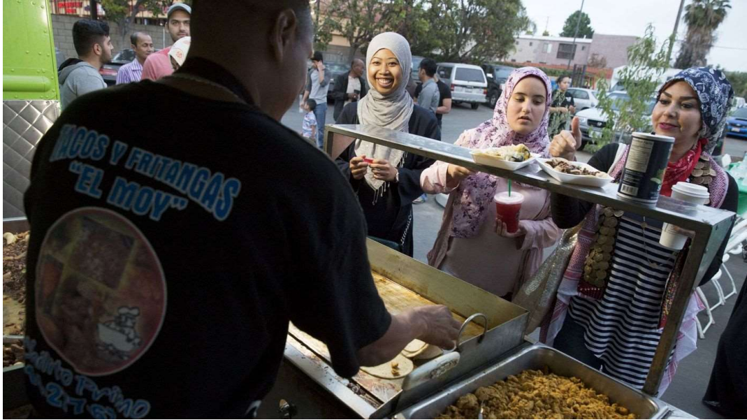
Muslim and Latino groups unite during Ramadan, breaking fast with tacos at mosques The Los Angeles Times, 4 June 2017