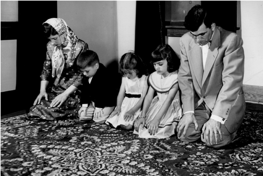
THE IGRAM FAMILY IN A MOSQUE IN CEDAR RAPIDS, IOWA