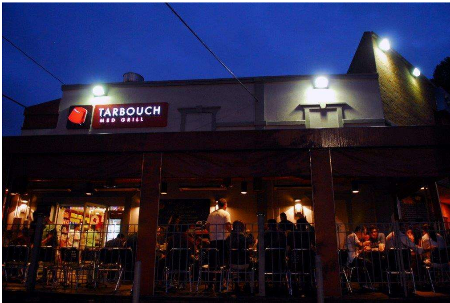
Tarbouch Restaurant in Arlington, Virginia