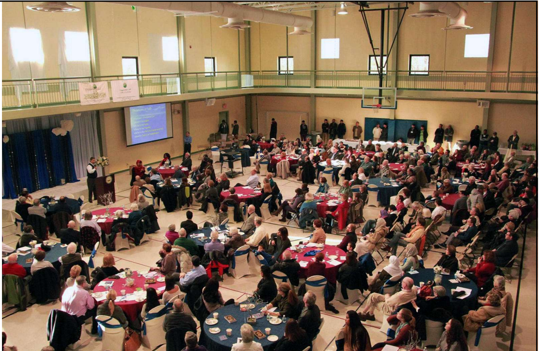
St. Louis, Missouri