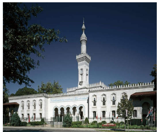
The Islamic Center of Washington