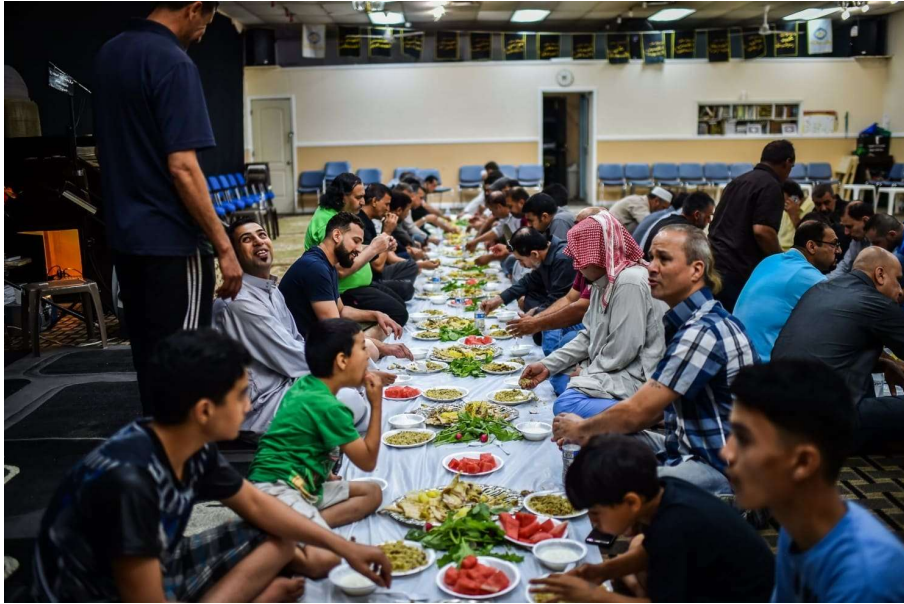
The iftar dinner at the Rafha Islamic Center during Ramadan on June 14, located on the border of Detroit and Dearborn, Michigan