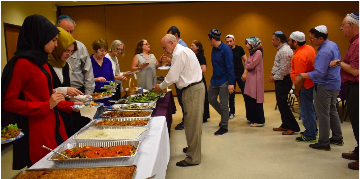
Interfaith Iftar at Congregation Beth Torah