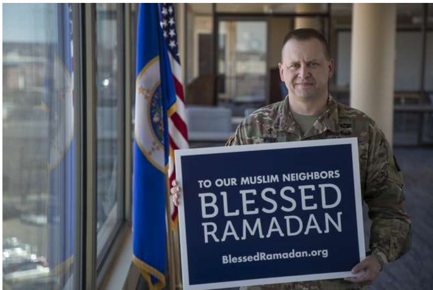
Minnesota National Guard members display signs created by the Minnesota Council of Churches